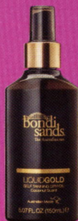
MIDAS TOUCH Bondi Sands Liquid Gold Self Tanning Dry Oil, $19.95