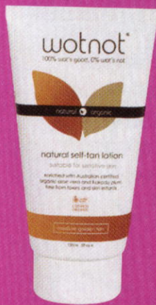
FAST WORK Wotnot Natural Self-Tanning Lotion, $29.99